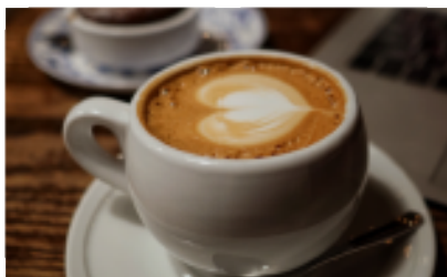
Lock Stock Coffee

At Lock Stock, espresso is pulled with care, savoury biscuits are baked fresh and heated to order, and English muffins are fried daily for a variety of sandwiches, making them a necessary stop when in the downtown neighbourhood.